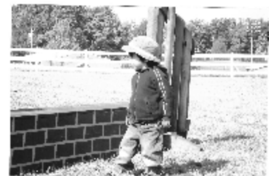
Our youngest helper at the Horse Show.